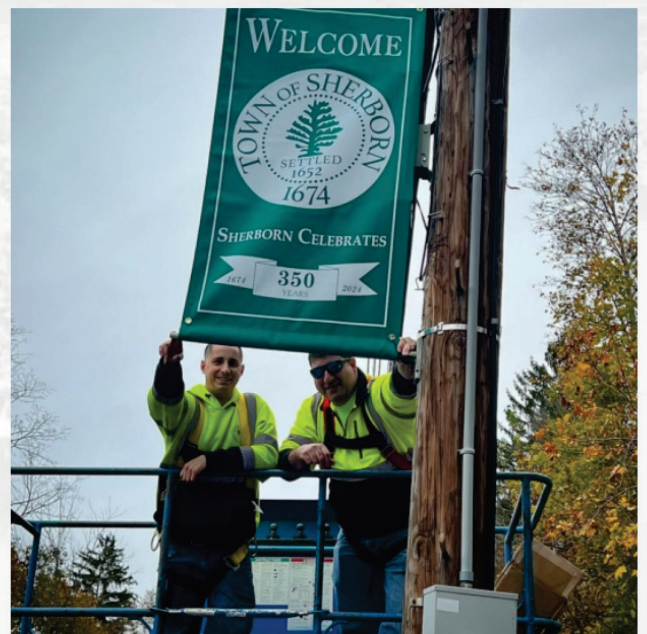
Sherborn DPW hangs new 350th Celebration banners in town center