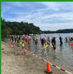
FOFP Admiral FunBelow Perimeter Swim