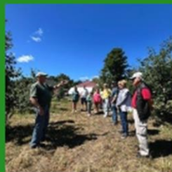
Sherborn Farm Day September 8, 2024