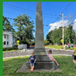
Ribbon Cutting Ceremony August 22, 2024