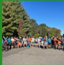
SherBorn to Ride