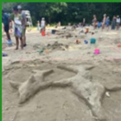
40th Annual Sand Sculpture Contest