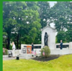
Memorial Day 2024