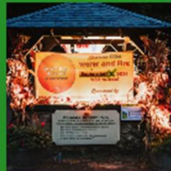
Water & Fire at Farm Pond