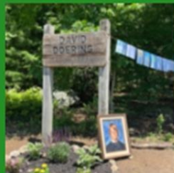
David Doering Nature Trail Rededication