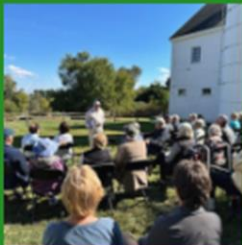
SRLF Turns 50!